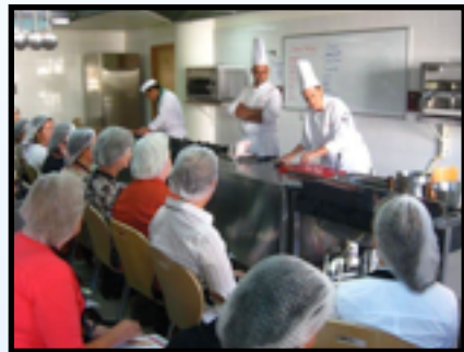
Meet the Chef at NHI (Top: AWG Chef) (Bottom: Class Instruction)

Over 25 ladies enjoyed a fun morning of cooking and lunching at the National Hospitality Institute (NHI) in November. The knowledgeable instructors at NHI demonstrated how to make a festive holiday meal of roasted turkey with stuffing, gravy, and an apple crumble tart with custard sauce. The ladies then enjoyed a delicious sit-down Christmas meal served by the students at NHI. Thank you NHI for donating door prizes and a wonderful morning of food & fun to get us in the holiday mood! If you are interested in joining one of the many leisure courses available at NHI (from pasty to wine appreciation), please contact them at businesscentre@nhioman.com or see their website at www.nhioman.com . AWG