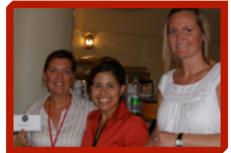
Door Prize Winners