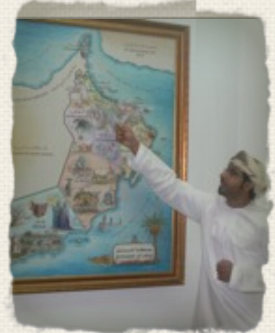
Our tour guide discusses Oman at Bait Zubair Museum