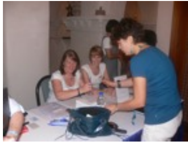
Signing up a new member at Bait Zubair

If you know of a friend or neighbor that have still not began receiving e-mail, please tell them to e-mail me at membership@awgoman.com with their membership number and first and last name and e-mail address and I will correct it, there were alot I could not make out due to the handwriting and I will have made some errors.