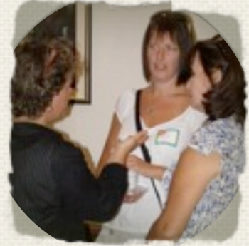
Newcomers Meeting, Getting to know one another