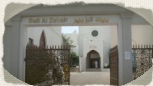
Bait Zubair Entrance