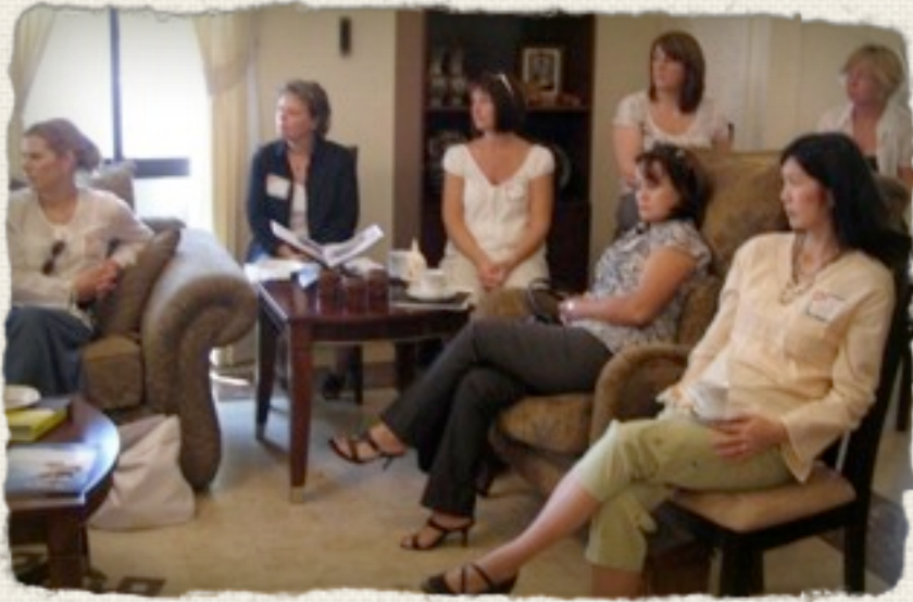
Newcomers Meeting, Sept 09