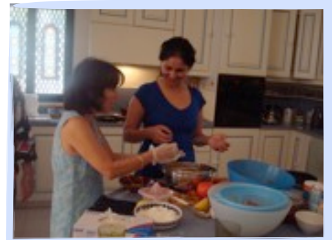
Cooking Group members work together

like a lot of fun to be had in the kitchen this year. The group meets once a month in the mornings at different members houses. One member does the cooking demo while another is the hostess. Everyone has a good time, eats, and gets to take home with them a new recipe and a full tummy. They will meet again on November 15th in the AM if anyone is interested in joining.